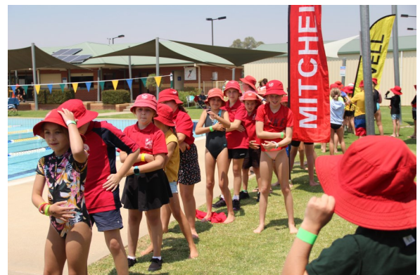
Dancing was a highlight of the day.