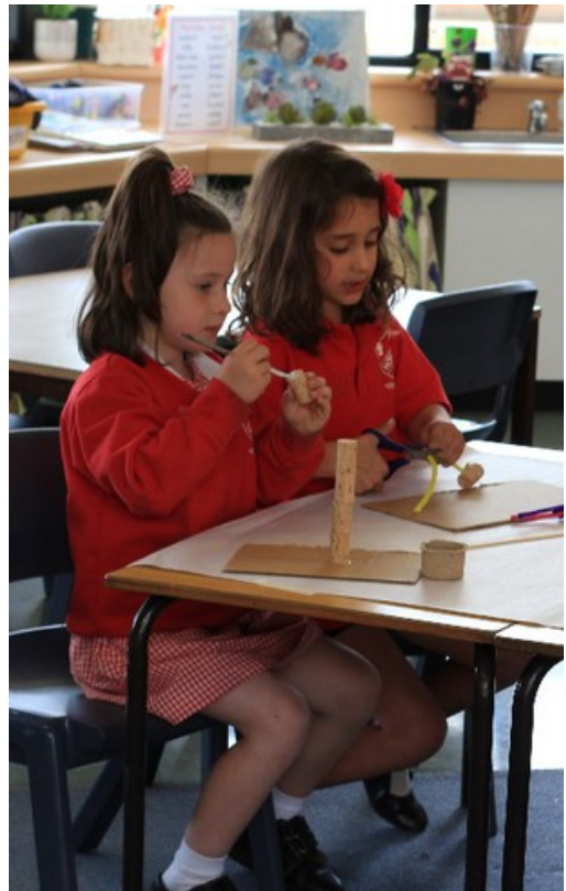
KN Friday afternoon Art

Students were given the challenge to create firework sculptures.