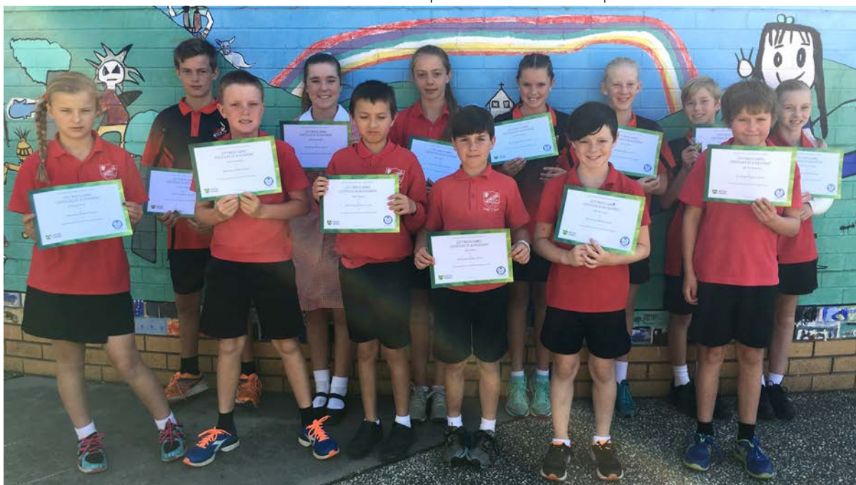
2017 Maths Games Participants and Champions.

PLEASE NOTE: Howlong Swim Centre will open to the general public on Saturday 25 November 1pm-7pm 7days.