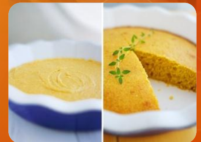
Pumpkin corn bread